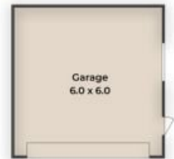
Garage 6.0 x 6.0

Approx. Floor Area | Internal 314 m 2 | External 122 m 2 | Total 436 m 2 | Lot 810 m 2